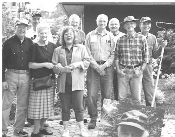
SHOVEL & RAKE The Guy Wheaton Award

honors those who serve in ministries within our congregation's life. This year The Shovel and Rake Gang was recognized. Week after week this dedicated group of men and women care for our buildings and grounds in a joyful fellowship.